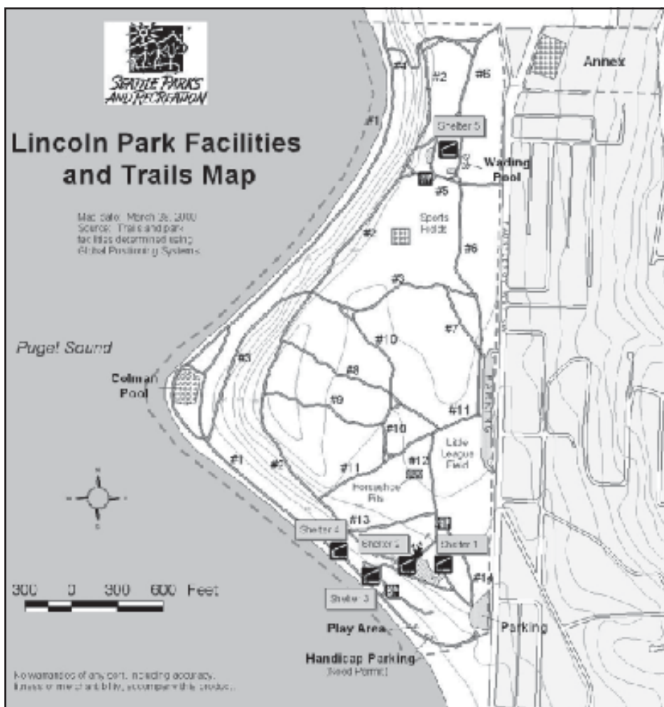
Lincoln Park trail map provided by the Seattle Department of Parks and Recreation.